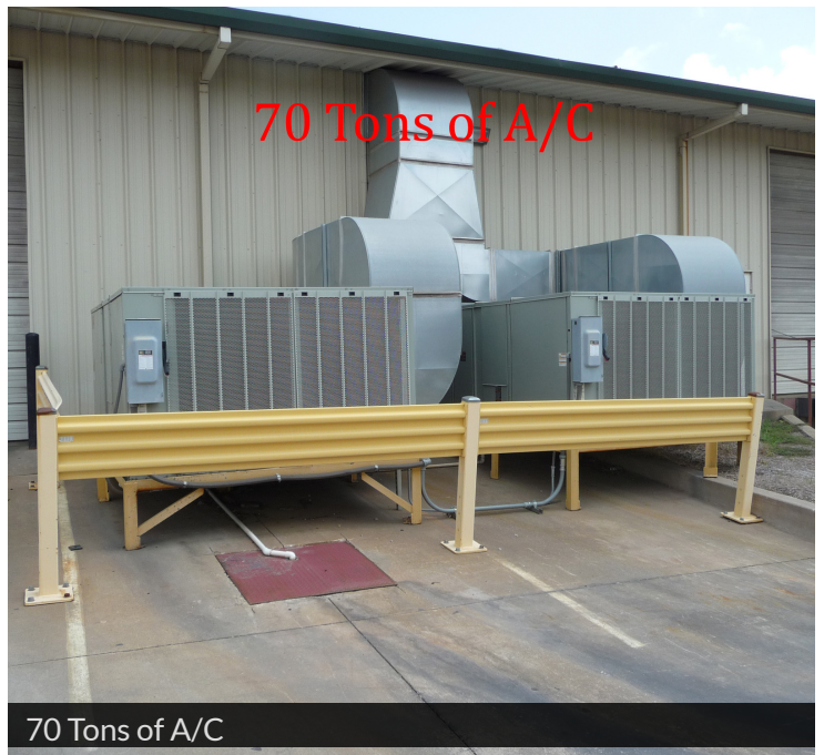
70 Tons of A/C